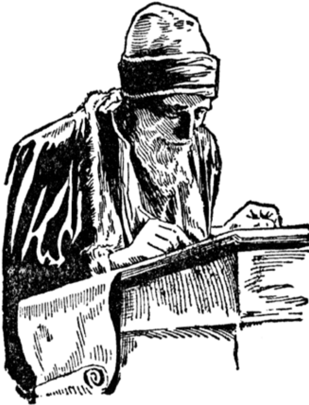
WRITING THE GOSPEL STORY.