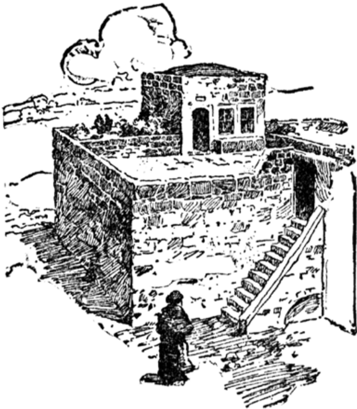
JEWISH HOUSE WITH A CHAMBER ON THE ROOF.